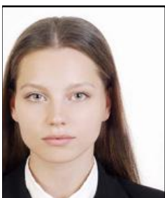
Subject is not centered

Photographs that do not meet the specifications listed above.