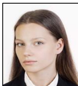
Subject's face is turned