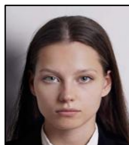
Shadows in the background